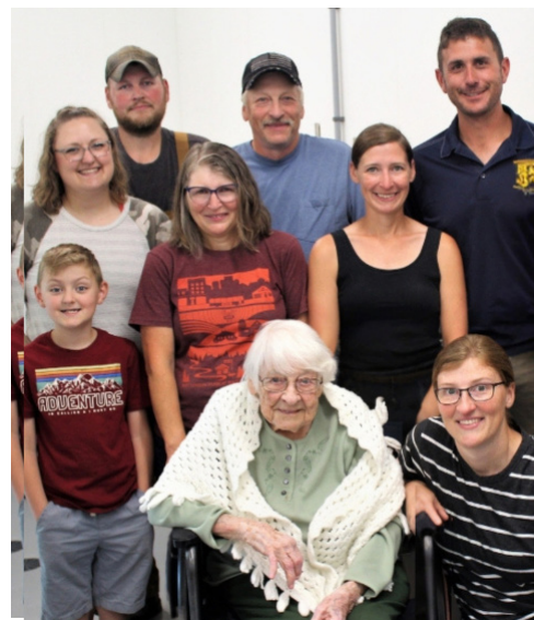
Klemish Family, Summer 2022