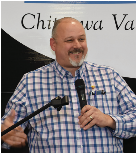
State Senator Jesse James

issues, the cost of CVEC's wholesale power increased 4 percent for 2023. He pointed out that these challenges are not exclusive to CVEC, noting that the average wholesale rate increase for all distribution co-ops is 5.3 percent, with the differences among them determined by load factors.