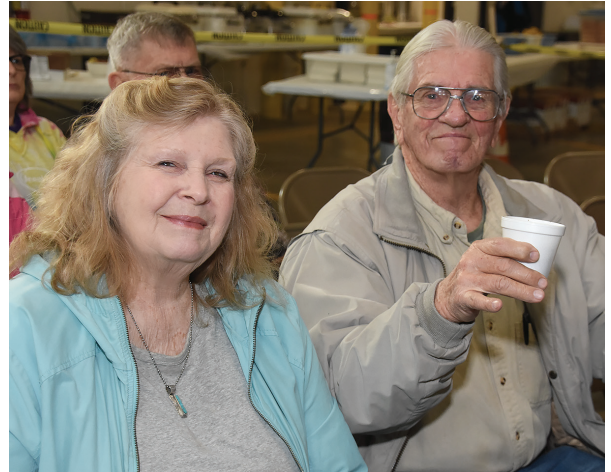
Members enjoyed coffee and doughnuts before the business meeting, and lunch after it.