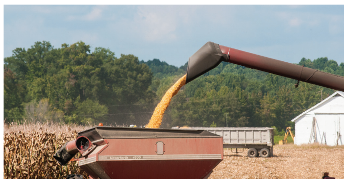
When practicing farm safety, consider all equipment and cargo extensions of your vehicle.

Every year, we see collisions where tractors and other farming equipment accidentally collide with utility poles and power lines, causing injuries and power outages. These dangerous accidents can be avoided by looking up and around