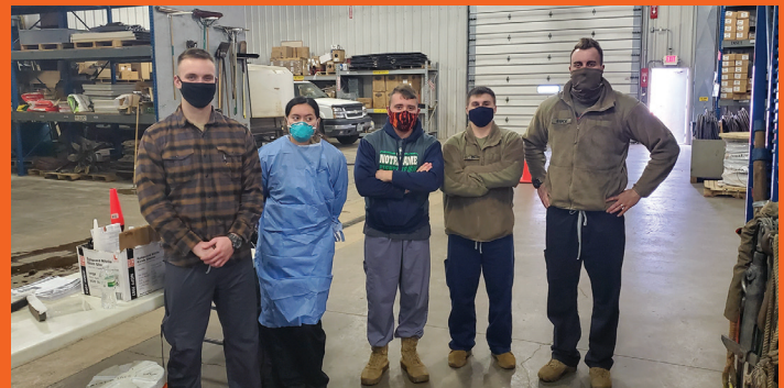
COVID-19 Test Site – CVEC's warehouse was used as drive-through test site with Wisconsin National Guard assistance.

Ntera – USDA Awarded Broadband Grant of $3 million for the expansion of fiber-fast services to local community. In addition, nearly $700,000 in grants were awarded to Ntera from the PSC. Ntera was formed in 2017 when two local cooperatives, Chippewa Valley Electric and Citizens Connected, joined forces with the goal of bringing fiber-fast services to underserved areas throughout Chippewa Valley.