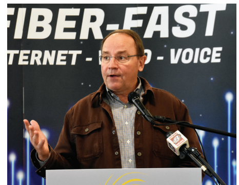
Congressman Tom Tiffany participates in USDA ReConnect grant presentation.