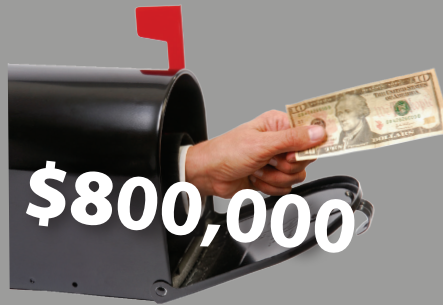
Capital Credits – Nearly $800,000 was given back to our members.

Rebates – Over $60,000 was given to our members for the purchase of eligible energy efficient items.