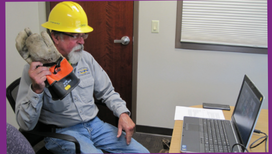
Safety Demo – CVEC continued to share safety messages via virtual safety demonstrations.