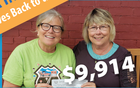
Operation Round Up - $9,914 was given to help those in need in our community.