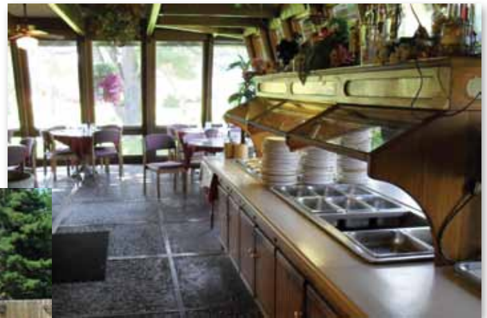
Above: The back of the inn has a dining area and buffet table. Left: In back of the inn, customers can relax and have an outdoor party.