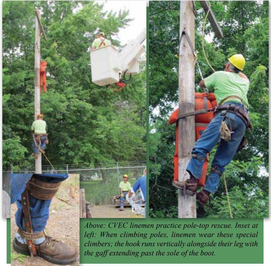
Above: CVEC linemen practice pole-top rescue. Inset at left: When climbing poles, linemen wear these special climbers; the hook runs vertically alongside their leg with the gaff extending past the sole of the boot.

Linemen use climbers when climbing a pole without rungs or without the benefit of a truck with a utility lift. The climbers are hooks that