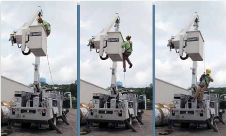
These photos show a bucket evacuation test in progress.

Preplanning for possible emergencies is important, and prompt action by trained employees is essential in effecting rescue operations. CVEC values its employees, and the purpose of this training is to help ensure that if an emergency situation should arise, linemen will react and respond properly to best protect the safety of themselves and their coworkers. ■